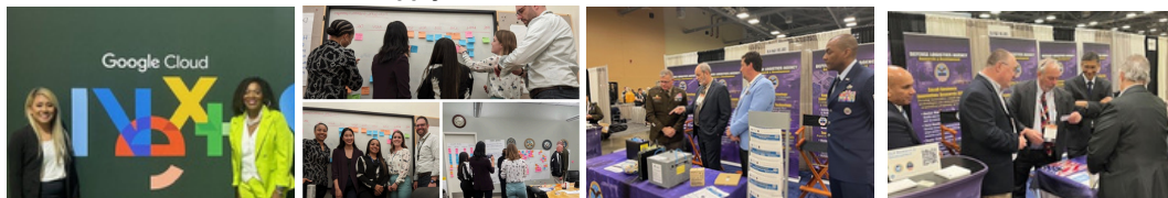
Land and Maritime Supply Chain Alliance Conference, Columbus OH